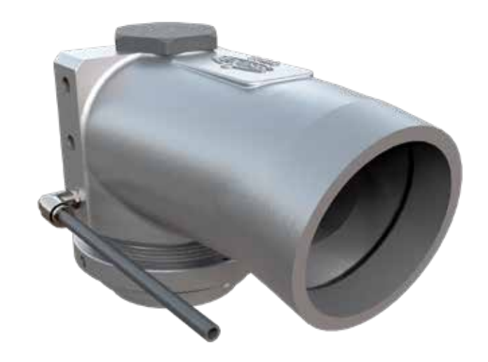
Ventris Vapor-Recovery Vent PART # VV100