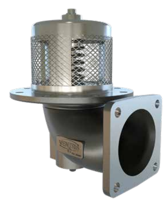
Ventris Internal Valve VEV100-1 (Square Flange Euro-100-1 Style)